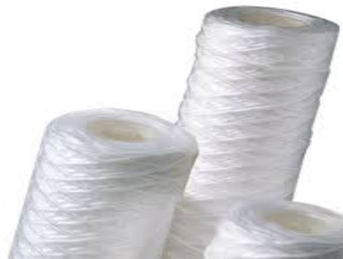
2.5" Diameter x 10" Length

Operating Temperature: 40°F to 165°F (4.4°C to 73.9°C)